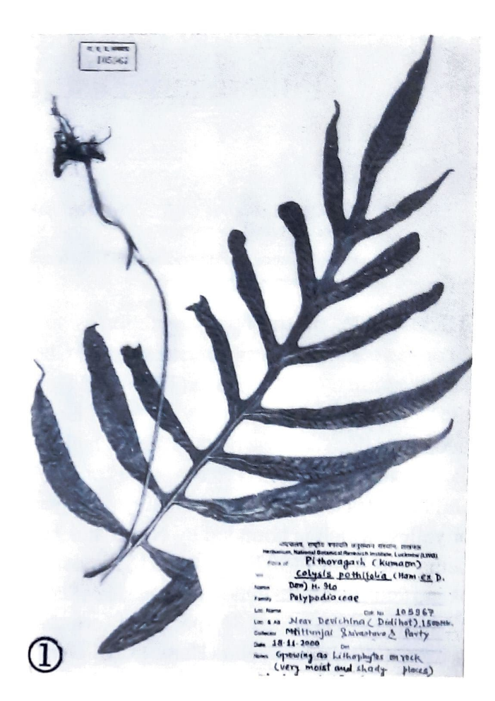
Figures: 1-2. Colysis pothifolia (Ham. ex D. Don) Presl: 1. Habit: 2. Venation

The species is growing as lithophytes on shaded rocks of closed forest.