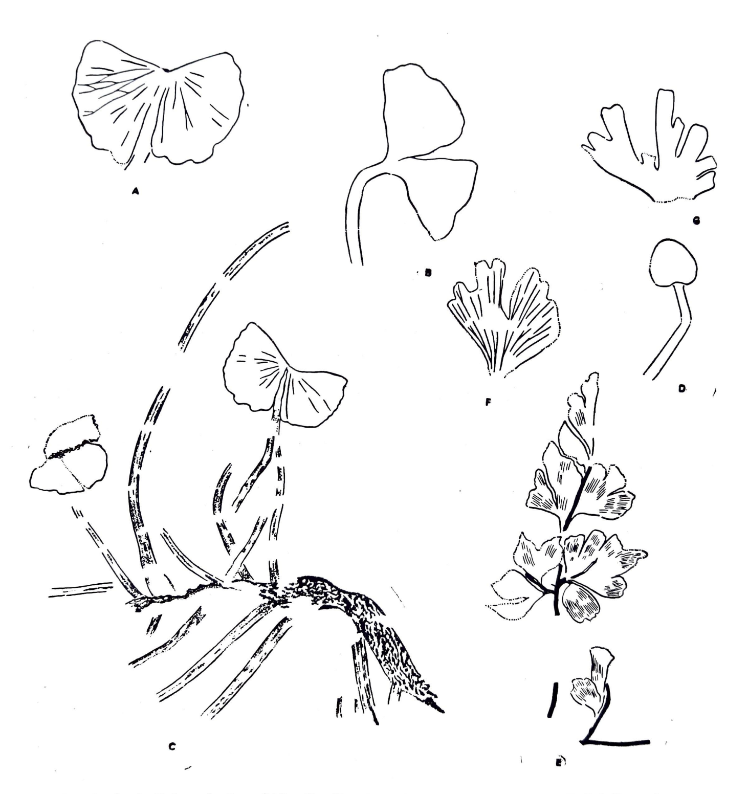
Text-fig. 1—A. Enlarge leaflets of Marselia—like plant showing venation pattern, B. S. I. P. specimen no. 35900, \times 6 . B. detached leaf of Marselia-like plant with two leaflets, B. S. I. P. specimen no. 35905, \times 6 ; C. specimen showing habit of plant, prostrate rhizome with upright branches and only one leaf with two leaflets are preserved, B. S. I. P. specimen no. 35900, \times 4 ; D. detached stalked sporocarp, B. S. I. P. specimen no. 35905, \times 6 ; E. frond of Adiantopteris sp. B, B. S. I. P. specimen no. 35897, \times 2 , F & G. Showing detached pinnae of Fern frond type 1 with lobed degitate lobes and forked venation, B. S. I. P. specimen no. 35898, \times Ca 4.

Comparison—The present specimens resemble somewhat with the figured specimen of Adiantopteris gracilis (Vassilevskaja) Samylina (1976) described from the Cretaceous of Omsukchan, Magadan District, U.S.S.R.